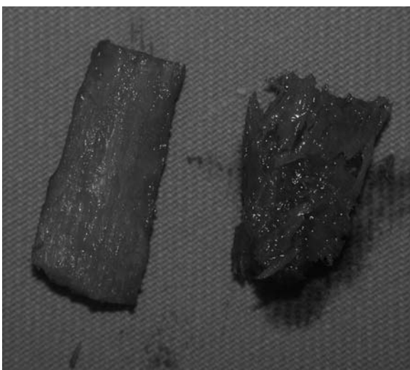
FIGURE 3. The view of the cortical fenestra and the harvested cancellous bone graft.

cortical bone out in an angled manner does not only facilitate repositioning after the cancellous bone graft is harvested, but it also increases the cortical contact surface, thus possibly decreasing the healing time. A cancellous bone graft can be safely harvested through the fenestra, with a depth of 1 cm (Fig. 4). After the harvest, the cortical cap is returned to the original location (Fig. 5). Suturing of the periosteal flaps