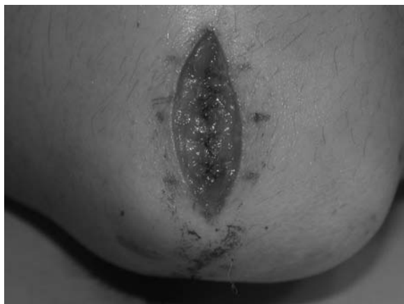
FIGURE 6. Suturing of the periosteal flaps.

One of the patients underwent surgery for a different metacarpal osseous defect in the same hand after trauma, 11 months after the initial surgery. Exploration of the former donor olecranon site displayed adequate healing and sufficient reserve for a secondary regrafting procedure.