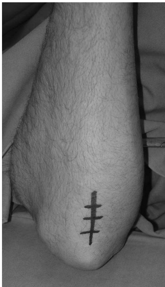
FIGURE 1. Three to 4 cm incision over the olecranon.

The procedures were performed under axillary block anesthesia and pneumatic arm tourniquet. The patient is placed in a supine position and the upper extremity is abducted as in regular hand surgery procedures. For bone graft harvesting, a bolster is placed under the arm, and the elbow is flexed over 90 degrees to provide adequate exposure to the surgical field. A longitudinal 3 to 4 cm incision is applied over the olecranon region (Fig. 1). As the only soft tissue over the bone is the origin of the deep flexor group posteromedially, simple dividing of the muscle provides adequate exposure. Opposing