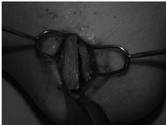
FIGURE 5. The cortical bone cap is replaced.

with an absorbable suture helps to stabilize the cortical bone (Fig. 6). No drains are applied and skin is closed with either absorbable or nonabsorbable material.