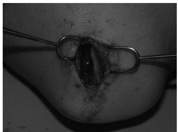
FIGURE 4. Appearance of the donor site before the cortical cap is replaced back to its place.