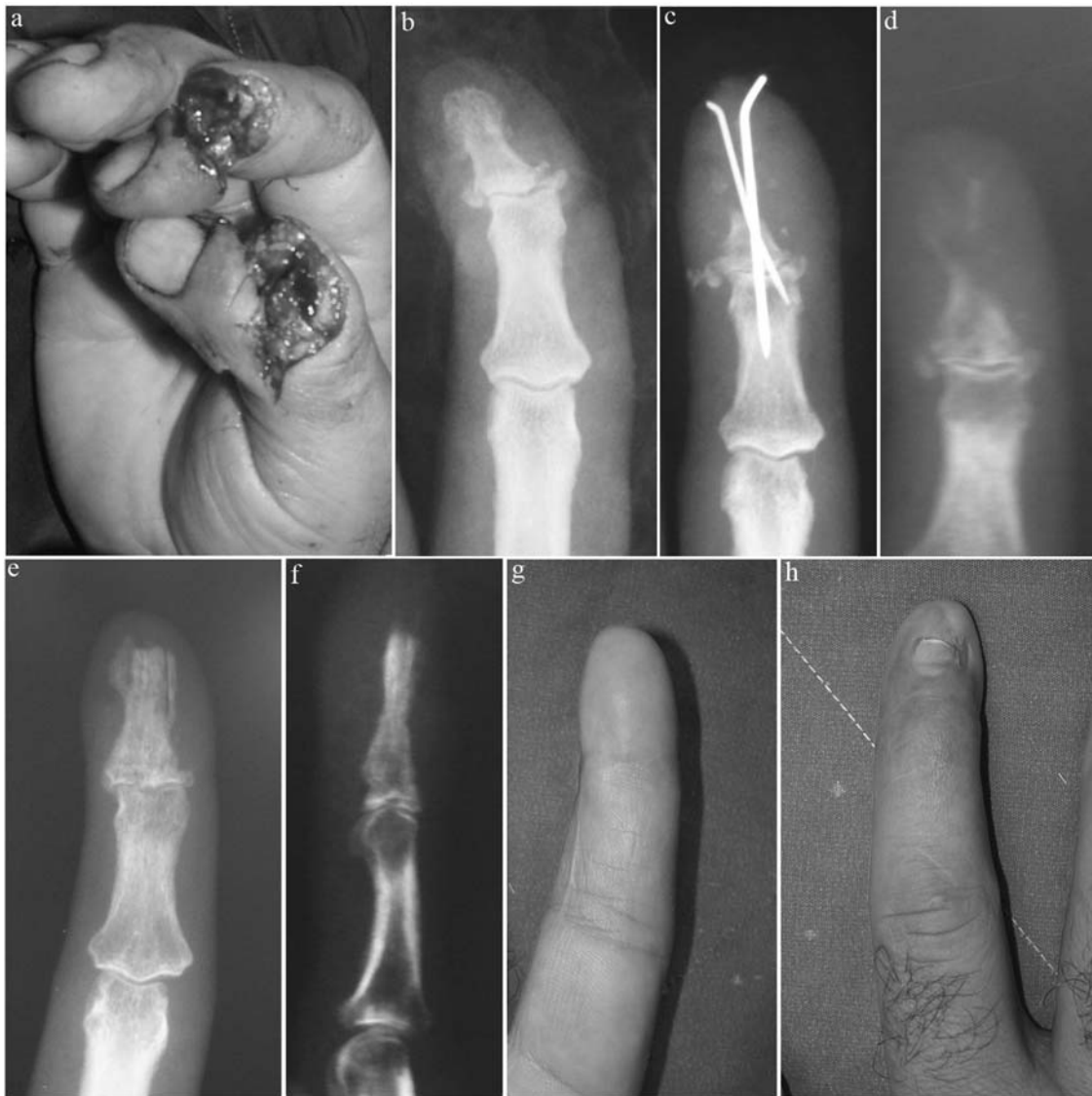
Fig 2 (a) Subtotal amputation of the index finger. (b) Luxation of DIP joint with small intra-articular fractures of the distal phalanx. (c) A pin track infection which caused bone resorption in the shaft of the distal phalanx. (d) The obvious bony defect after control of infection. (e) Anteroposterior view 6 months after successful olecranon bone grafting. (f) The bone graft replaced the distal phalanx successfully. Lateral view. (g, h) The finger pulp and nail 6 months after olecranon bone grafting.

All the patients were operated on under axillary regional anaesthesia. The 3 cm incision for bone graft harvesting was made starting 1.5 cm distal to the tip of the olecranon (Fig 3). The incision was made through the periosteum which was dissected off the bone graft donor site of the olecranon. A rectangular cortical window was removed and preserved to expose the medullary cavity. The cancellous bone graft was harvested by using a fine osteotome. The cortex was replaced and closed after harvesting the graft to prevent a palpable irregularity at the donor site. Cancellous bone grafts were used in all