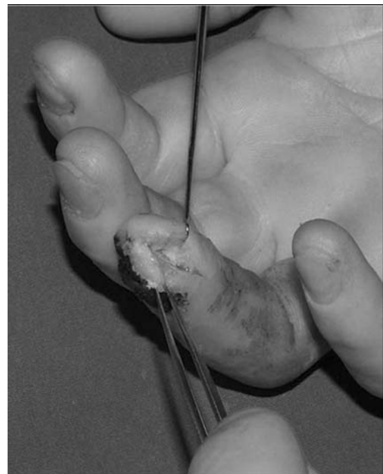
Fig 4 The midlateral incision at the recipient site.

Ten out of the 11 patients had complete radiological union at the grafted sites. One patient had partial radiological union with complete disappearance of the clinical signs of nonunion. None of them had pain,