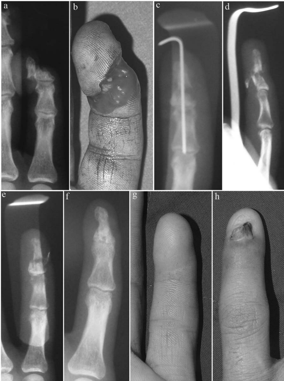
Fig 1 (a, b) Subtotal amputation of little finger. (c) Initial treatment with K-wire fixation in a distracted position which most likely caused nonunion. (d, e) Nonunion at the shaft of the distal phalanx with pain and deformity 5 months after the initial treatment. (f) Seven months after olecranon bone grafting the bony healing was complete. (g) The view of finger pulp after treatment. (h) There was a nail deformity that was probably due to the initial injury and repair.