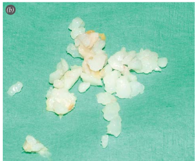
Fig. 2. (a) Intraoperative view of the lesion, and (b) excised specimen.