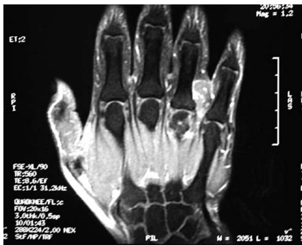
Fig. 1. Appearance of the lesion on MRI.